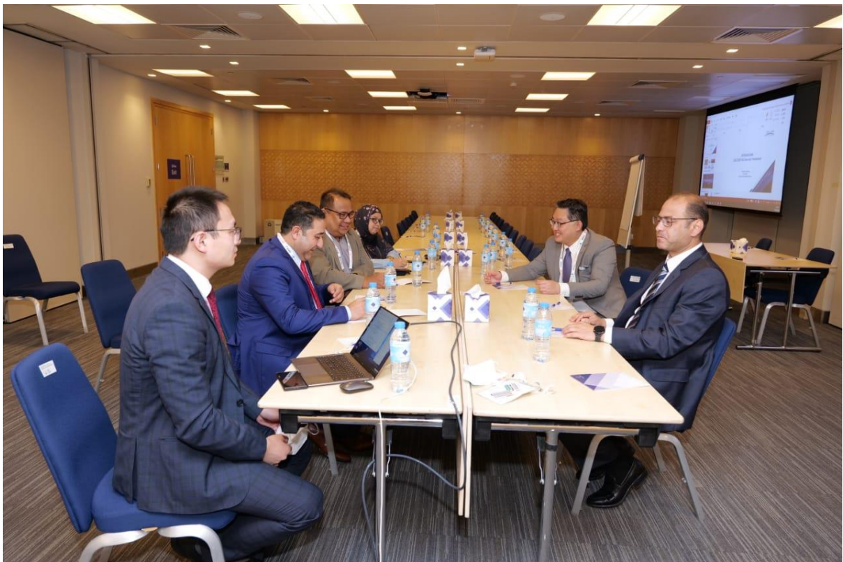
Figure 3: Meeting on OIC-CERT 5G Security Framework and Roll out plan