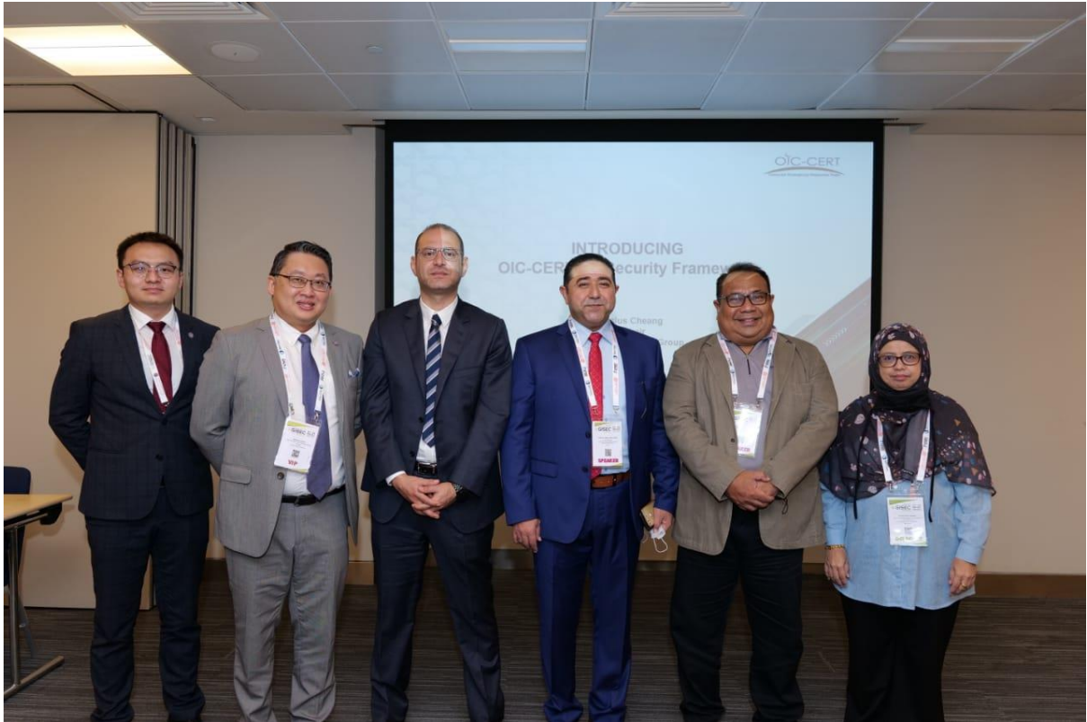
Figure 2: OIC-CERT 5G Security - Co Chair: Permanent Secretariat and Huawei UAE